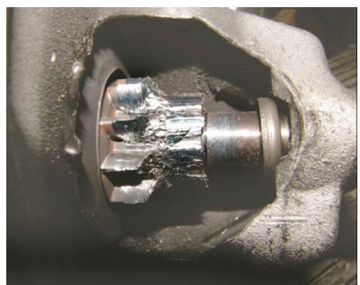
Damaged Starter Drive Gear