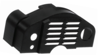
Drip guard engineered by MPA.

In an effort to address this problem, MPA engineers developed a fitted, oil-drip guard for the alternator.