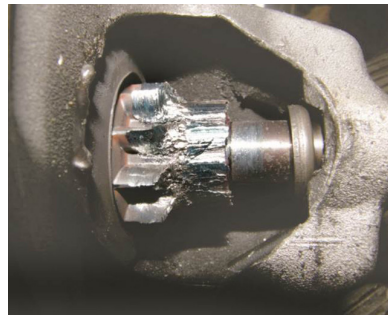
Damaged Starter Drive Gear