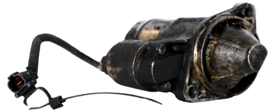
Oil Soaked Starter